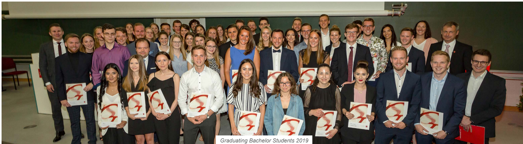
Graduating Bachelor Students 2019