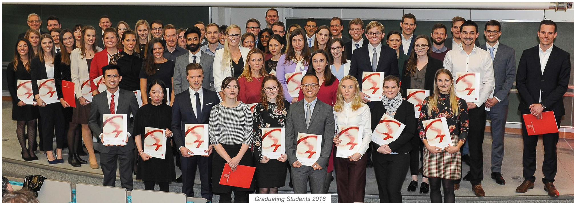
Graduating Students 2018