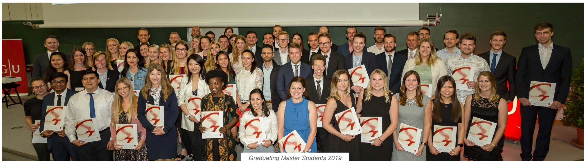
Graduating Master Students 2019