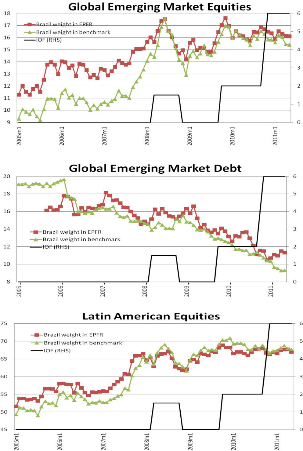
Figure 1: Fund Exposure to Brazil and the IOF Tax

Notes: Brazil weight in EPFR is the average share of the funds portfolio allocated to Brazil. Benchmark is the weight of Brazil in the MSCI benchmark for equities or JPMorgan EMBI Global benchmark for bonds. IOF is the tax on foreign investment in fixed income.